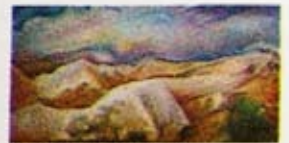
Sacred Lands/Tierra Sagradas