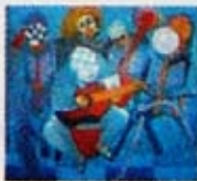
The Old Men/Los Viejos